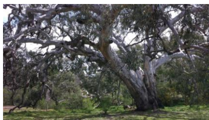
An old gum at Woodlands Park

Every year HBCC provides a trip for those who have helped out at their many working bees over the previous year. This year about 30 people from a number of friends groups travelled to Woodlands Historic Park in Greenvale.