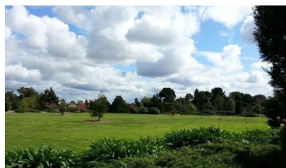
The lawn of the arboretum

The members' end of year get together will be held at Pavey Park on Thursday 8 December, from 5:30 to 8:00pm. We will supply food and fruit juice and good company! You must RSVP by 3 December to Lorraine on 043 830 7002